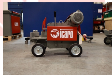
Cutter left side