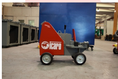
Cutter right side