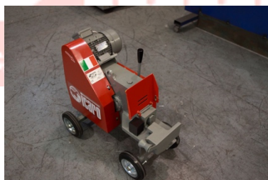
Cutter front side